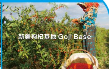
新疆枸杞基地 Goji Base