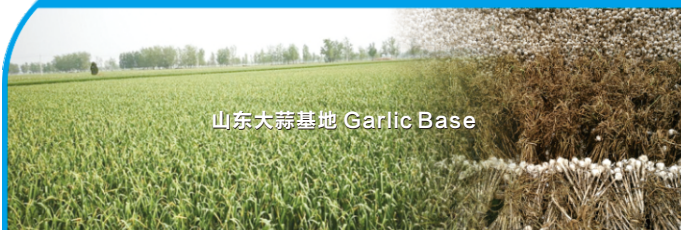
山东大蒜基地 Garlic Base